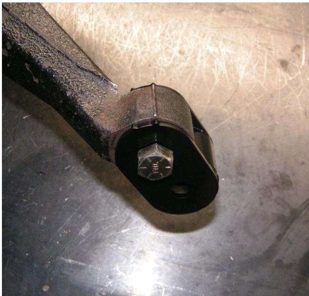
Figure 2: 91 Bracket Install