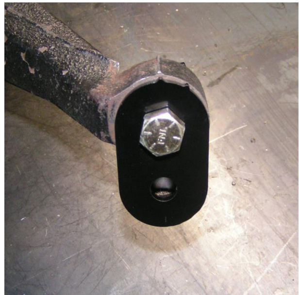
Figure 3: 93+ Bracket Install