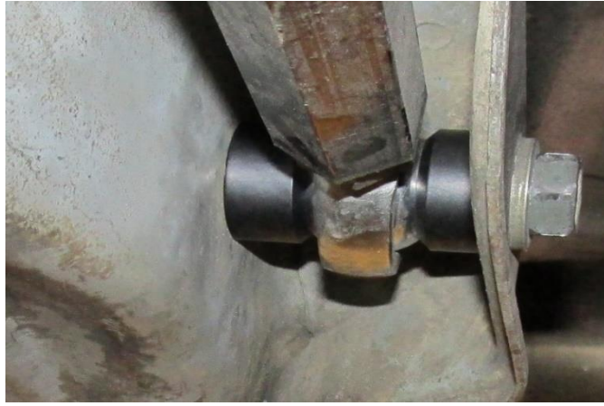
Figure 4: Rear Tie Rod Installation